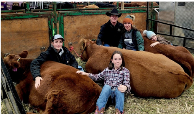
The Spray family with some of their cattle